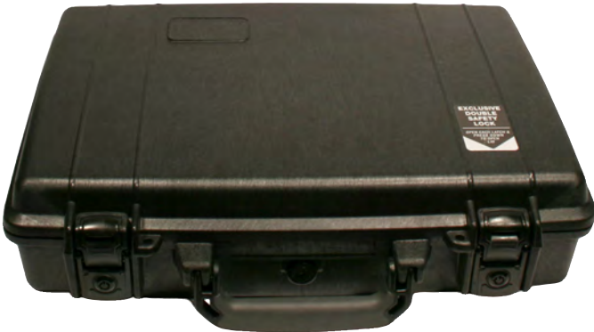
Case with foam cutout - Length 16" x Width 10 3/4" x Height 3 3/4" Depth of base - 2 1/2" x Depth of Lid - 1 1/4"